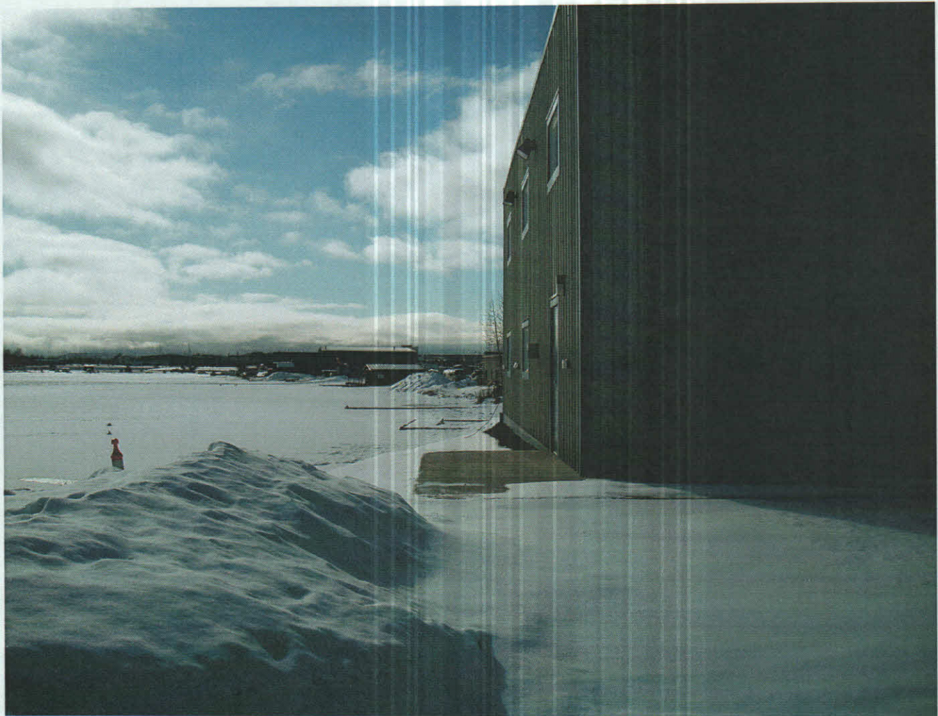
LOT 5C, BLOCK 14, MARCH, 2008 "Front, Left Side View"